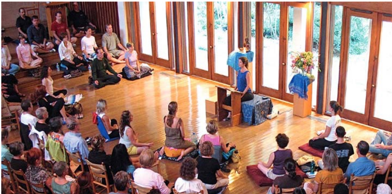
Image © Tara Brach, Guided Meditations - Basic Meditation.' www.tarabrach.com .

Interestingly enough in the second half of 2020, in the midst of all the Covid doom, gloom and mounting repression, a great deal of 'seers' have suddenly started talking about the shift in spiritual frequency of humanity and how this is leading to ever greater enlightenment. According to the leading figures in this growing movement, this frequency is increased through meditation, positive visualisation and prayer all of which help ordinary people become 'workers of light' in these dark and difficult times.